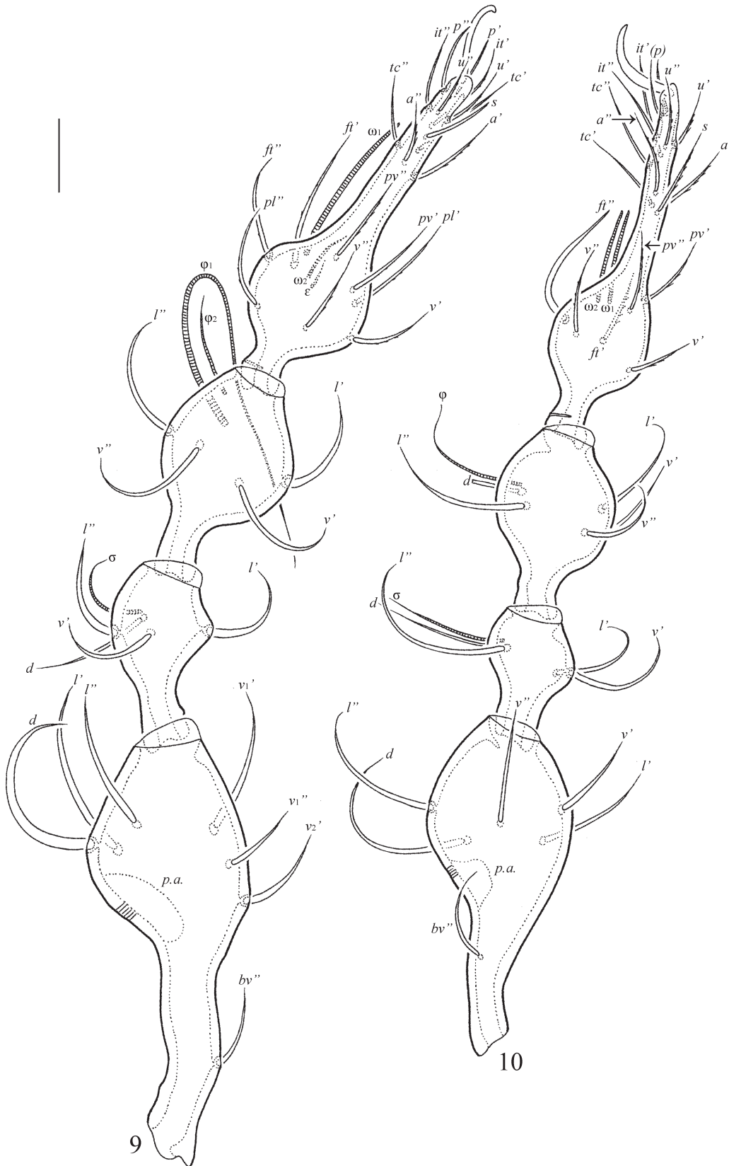
Figs. 9–10. Belba cornuta Wang et Norton, 1995: 9—leg I, without trochanter, right, antiaxial view; 10—leg II, without trochanter, right, antiaxial view (seta d broken on tibia). Scale bar 17 \mu m.

and aggenital setae setiform, thin, smooth; discidia narrowly triangular; anal and adanal setae sparsely