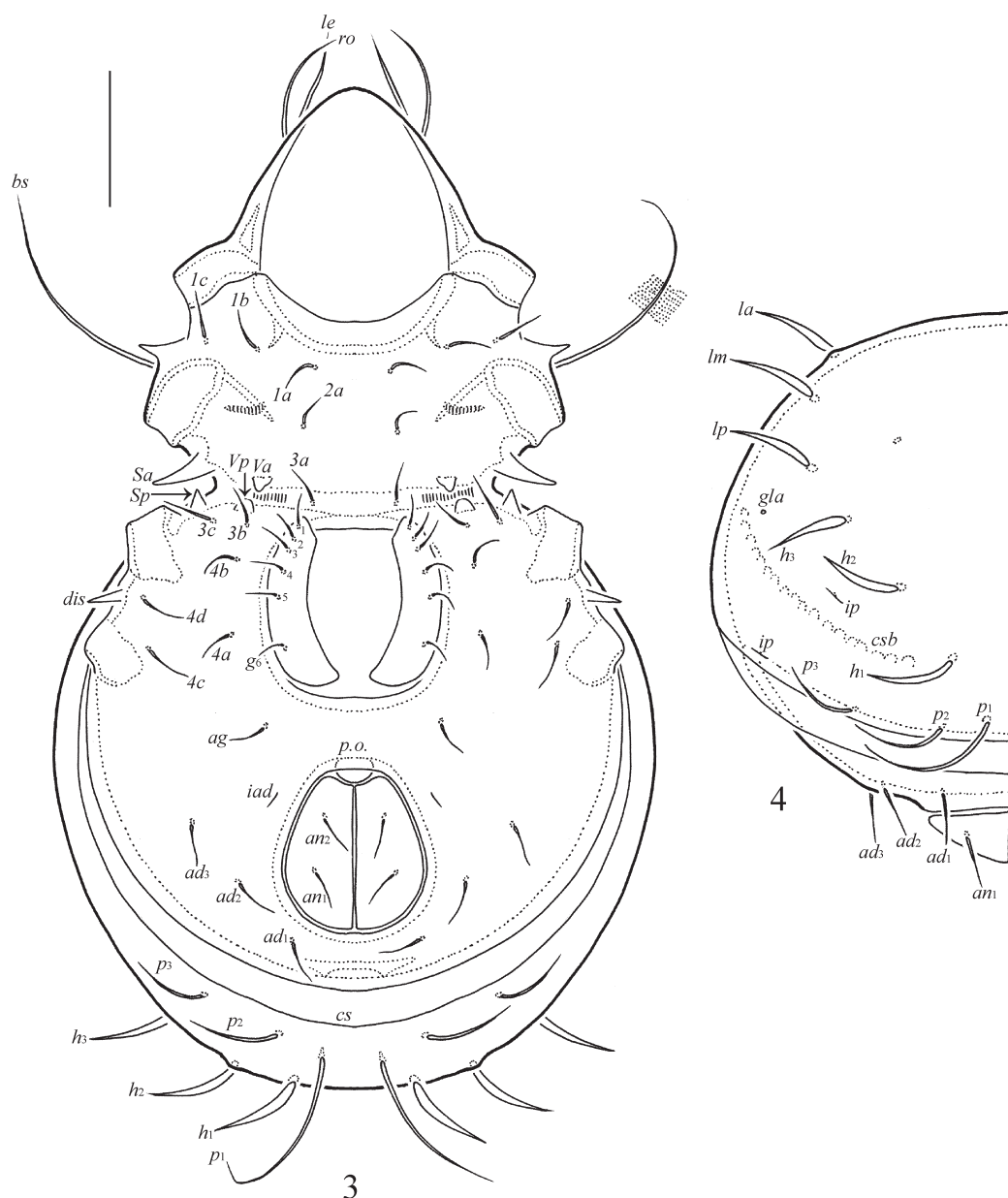
Figs. 3–4. Belba cornuta Wang et Norton, 1995: 3—ventral view (gnathosoma and legs not shown); 4—posterior view (left half). Scale bars 50 \mu m.

(49–53) with setation 0–2–1–3–9(+ \omega ). Solenidion bacilliform, pressed to surface of palptarsi medio-basally. Postpalpal setae (4) spiniform. Chelicerae (73–77) with 2 setiform setae, cha (20–22) barbed, chb (14–16) ciliate unilaterally in mediodistal part. Trägårdh's organ of chelicerae elongate triangular.